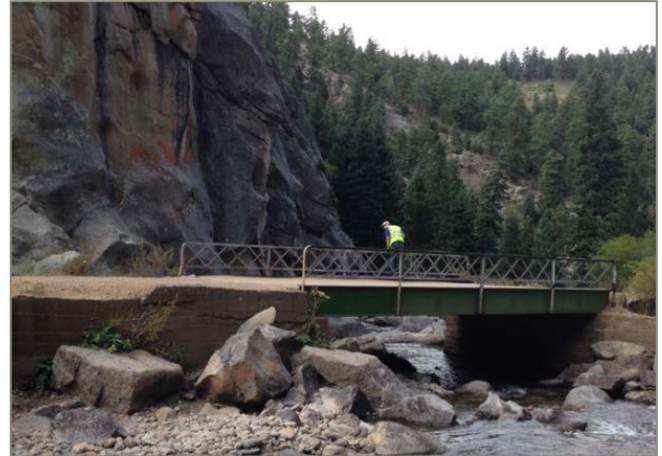
Figure 2: Field Survey Effort