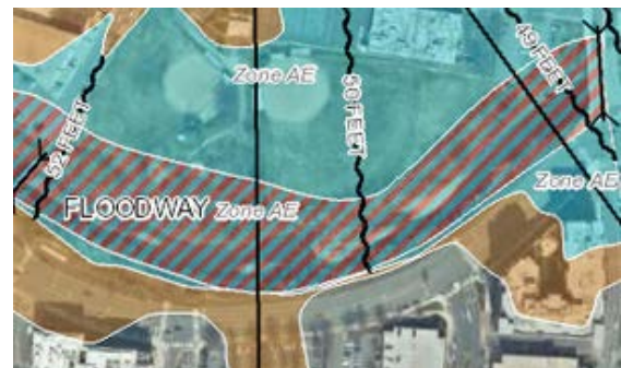
Figure 3: Sample Results

Since topographic data is a snapshot in time, local communities and counties have also been providing updated information for areas where there are multiple concurrent construction and/or recovery efforts happening. If it is possible within the project timeline, updated information is incorporated into the CHAMP modeling; if they are not captured, additional changes still can be made to these studies after CHAMP is finalized through FEMA's Letter of Map Change (LOMC) process.